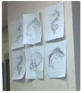
Some current Bangor MS artwork