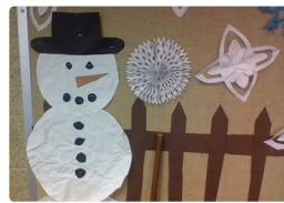
Some current Bangor MS artwork